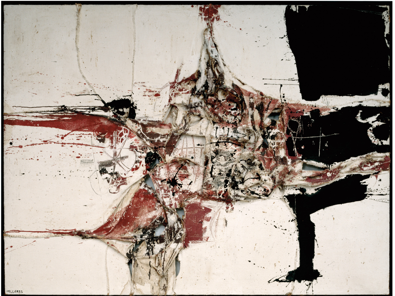
MANUEL MILLARES | Pintura n°5 | 1959

In informalist works, matter, strokes, colours and shapes become an explicit manifestation of the artist's energy and intention, as well as telling us about the context in which they were created. In order to close the communicative circle of art, the artworks need to be nourished by our reaction in the form of feelings and emotions. So, what does this work make you feel? How would you translate the different feelings into plastic solutions?